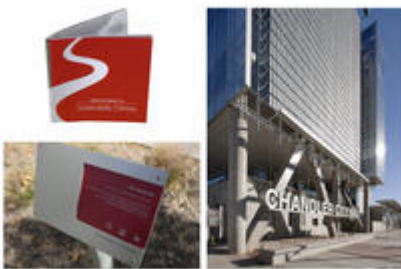
Images of “Sustainability Pathway” and “Turbulent Shade” façade system

A very accessible dialog of sustainability has been interwoven into the project through two key elements. A poet and graphic artist created the “Sustainable Pathway,” which provides visitors a self-guided tour of the building's sustainable elements marked by descriptive signs and noting whether the strategy is socially, economically or environmentally focused. A public artist created “Turbulent Shade,” an shading element that is very much connected to the physical environment by moving with the wind. Sustainability is on display for the community to interact with.