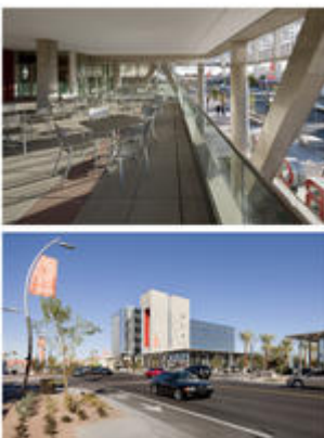
Views of open mezzanine and street frontage