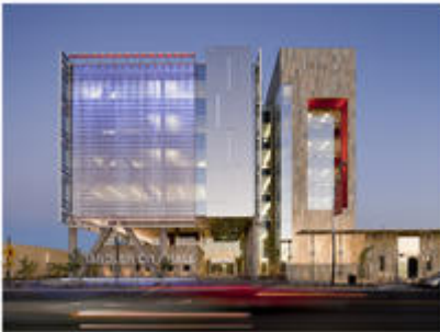
View of office tower from west