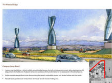
Loop Road