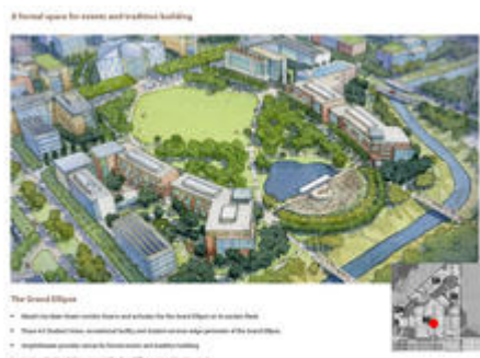
Grand Ellipse