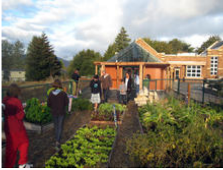
Students learning in outdoor garden classroom - Photo Credit: Opsis Architecture

Design of the site combines low-water, native vegetation, which populates 18,100 sf—nearly all of the landscaped area surrounding the project. The building footprint was minimized to allow 21,560 sf of vegetated open space to be preserved.