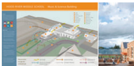
Resource flow diagram (left), entry doubles as outdoor amphitheater (right) - Photo Credit: Opsis Architecture (left). Michael Mathers (right)

The new building provides a home for the school's remarkable and unique Outdoor Classroom Project, a middle school science curriculum based on the principles of permaculture. Students combine classroom learning with hands on learning through activities such as cultivating food in a garden, harvesting and cooking the food and selling it at an on-site open market. In keeping with the concept of permaculture, it was important for the building to be a showpiece of sustainable ideas and a teaching tool for the students. This led to a desire to create a net-zero-energy building for which the students could track and budget energy use.