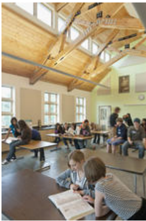
Clerestory windows bring in ample natural daylight