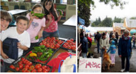
Students (left) preparing their vegetables for the Gorge Grown Farmer's Market (right)

The school sits at the heart of Hood River, a small community in the Columbia River Gorge, and serves as a host to a variety of community events. The interface between the building and its environmental and cultural landscape is particularly important for the curriculum at Hood River Middle School. The new music room will not only provide a new home for the school's music classes but will also be available for other community arts groups. The students' growing and harvesting efforts in the greenhouse and garden serve as a venue to bring the larger community to the school campus; every Thursday, students participate in the Gorge Grown Farmer's Market hosted at the school site. A new outdoor amphitheater overlooking the greenhouse is also accessible to the public in addition to serving as an outdoor classroom project.