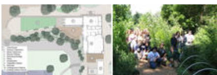
Site Usage Diagram (left), students maintain a low-water, native vegetation garden (right)