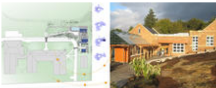
Climate analysis (left) influenced the building orientation which shelters the entry (right) from prevailing winds

The project is located in a scenic area near the Columbia River Gorge, a site that receives moderate annual rainfall, good solar exposure and significant seasonal temperature swings. It is fairly rural in character, surrounded by farms, orchards, and Hood River's downtown Main Street to the northeast.