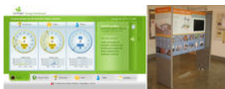
Earthright Energy Dashboard (left) displays current building energy use online and on-site on an informational kiosk (right)

Energy, daylight, electric lighting and solar access were all modeled during the design of the building. Different configurations of skylights and clerestory windows were examined in both the daylight and the energy models, and these models were essential in finding a balance between benefits for both these systems.