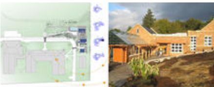
Climate analysis (left) influenced the building orientation which shelters the entry (right) from prevailing winds

The project is located in a scenic area near the Columbia River Gorge, a site that receives moderate annual rainfall, good solar exposure and significant seasonal temperature swings. It is fairly rural in character, surrounded by farms, orchards, and Hood River's downtown Main Street to the northeast.