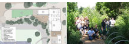
Site Usage Diagram (left), students maintain a low-water, native vegetation garden (right)