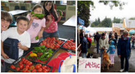
Students (left) preparing their vegetables for the Gorge Grown Farmer's Market (right)

The school sits at the heart of Hood River, a small community in the Columbia River Gorge, and serves as a host to a variety of community events. The interface between the building and its environmental and cultural landscape is particularly important for the curriculum at Hood River Middle School. The new music room will not only provide a new home for the school's music classes but will also be available for other community arts groups. The students' growing and harvesting efforts in the greenhouse and garden serve as a venue to bring the larger community to the school campus; every Thursday, students participate in the Gorge Grown Farmer's Market hosted at the school site. A new outdoor amphitheater overlooking the greenhouse is also accessible to the public in addition to serving as an outdoor classroom project.