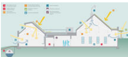
Light and air flow diagram

To achieve the optimum level of daylight in the science and music classrooms and energy efficiency, the project team performed multiple detailed daylighting studies. The resulting design combines translucent skylights, clerestory windows and traditional windows with deciduous vines for seasonal shading, allowing views in multiple directions from most building locations. Light-colored acoustic panels help reflect natural light from the clerestory windows deep into the classroom space. Fresh air is provided by a system combining operable low and high clerestory windows and rooftop ventilators to allow cross and stack ventilation.