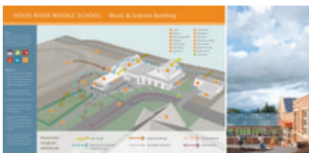
Resource flow diagram (left), entry doubles as outdoor amphitheater (right) - Photo Credit: Opsis Architecture (left). Michael Mathers (right)

The new building provides a home for the school's remarkable and unique Outdoor Classroom Project, a middle school science curriculum based on the principles of permaculture. Students combine classroom learning with hands on learning through activities such as cultivating food in a garden, harvesting and cooking the food and selling it at an on-site open market. In keeping with the concept of permaculture, it was important for the building to be a showpiece of sustainable ideas and a teaching tool for the students. This led to a desire to create a net-zero-energy building for which the students could track and budget energy use.