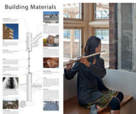
Building Materials/Wall Section (left), Exposed wall section for visual learning (right) - Photo Credit: Opsi Architecture (left), Michael