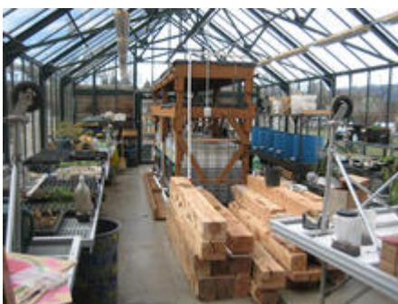
Blue barrels store collected rainwater for irrigation - Photo