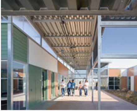
Floating canopies for all circulation and common spaces, as shown in the photo, contrast in character and form with the prefab components of the facility.

High Tech High Chula Vista is a public charter school serving 550 students in grades 9 to 12 with an approach rooted in project-based learning. The school fosters student engagement by knowing students well, tapping into student experience and interests, and building a strong sense of community. Through internships and projects based in the community, students collaborate with adults on work with meaning that extends well beyond the school walls.