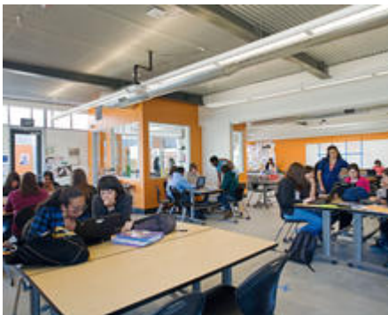
This photo shows students working in small groups in a typical paired classroom with the movable wall open. The teacher offices penetrate into the space to facilitate constant access between the students and faculty.