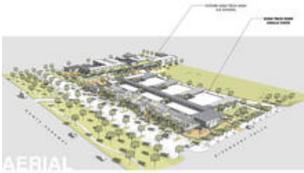
This computer rendering shows an aerial view of the site plan. - Photo Credit: Studio E Architects

The school serves a regional population and does not offer busing. To reduce the number of cars driving through the community to the school and the number of cars needing to park on the site, the school chose a site near mass transit nodes and established a comprehensive Transportation Demand Management (TDM) Program. The program works on both the supply-side and the demand-side of the parking equation. The program includes: