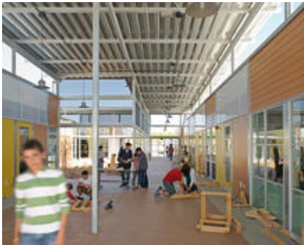
Exterior spaces adjacent to classrooms are used as workshop spaces in the project-based learning environment shown in the photo.