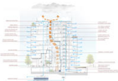
Diagram of East-West section showcasing the water and climate strategies in place. These involve collection and remediation of rainwater runoff, and the use of natural ventilation for portions of the year.

The Atrium provides opportunities for casual and planned encounters while doubling as a forum for special events for the school. It is filled with generous daylighting and equipped with LED 'butterfly' chandeliers.