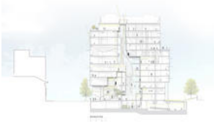
East-West Section showing daylighting in the building. - Photo Credit: Behnisch Architekten

The radiant slab system maintains the massive concrete structure at a stable temperature, while a low-volume dedicated outdoor air system with enthalpy wheel heat recovery provides ventilation when outdoor conditions are not favorable for natural ventilation.