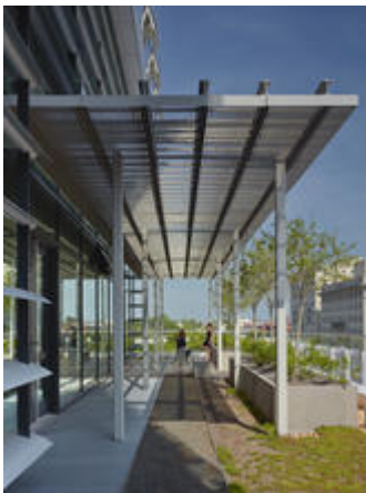
Roof terraces provide users with access to fresh air and collect rainwater runoff for remediation and reuse.