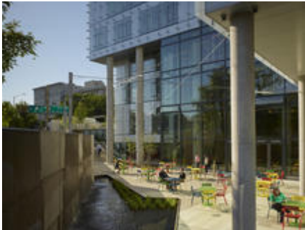
Sunken Garden located below grade at level 00 providing the site with visual and acoustical buffer to the freeway.