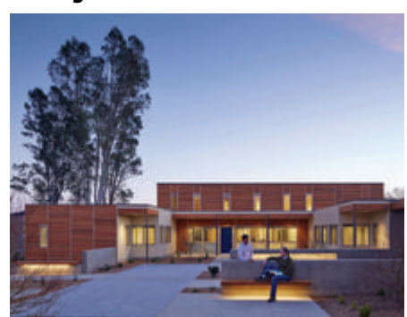
Entry Courtyard At Residence - Photo Credit: Tim Griffith

Sweetwater Spectrum is a new national model for supportive housing for adults with autism, offering life with purpose and dignity. Created to address a growing housing crisis for adults with autism, this new community for sixteen residents integrates autism spectrum design, universal design, and sustainable design strategies.